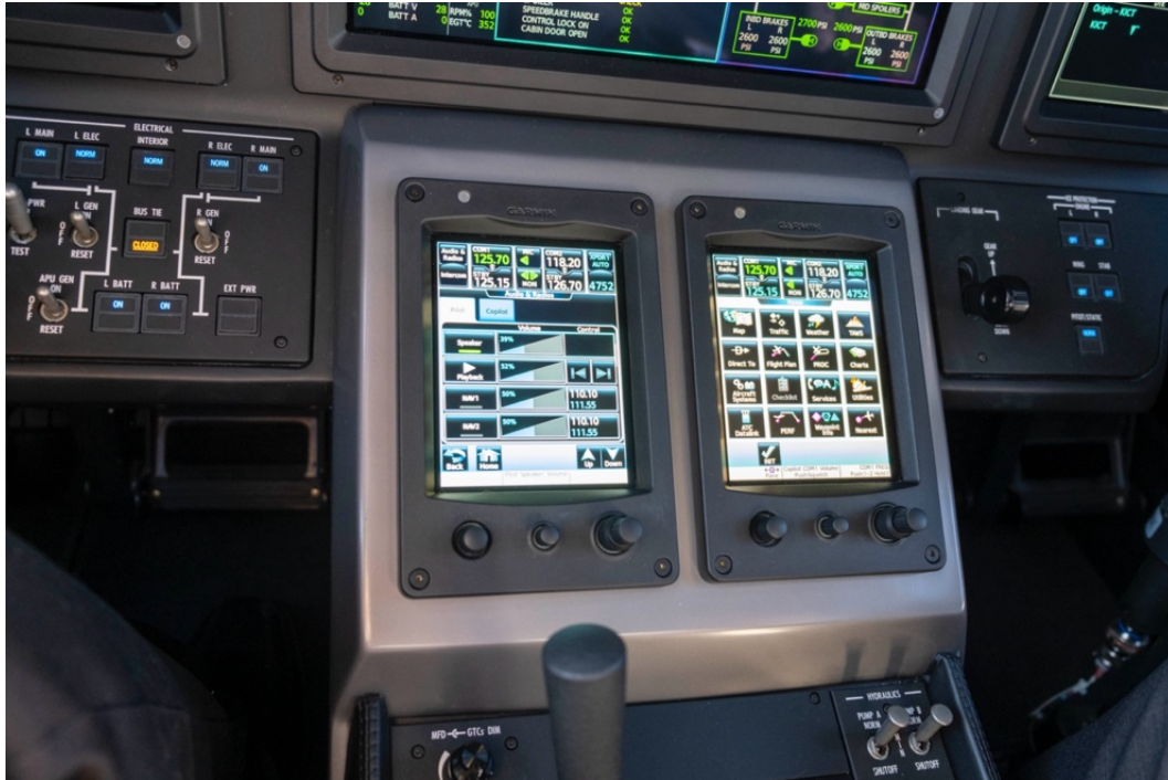
The two center Garmin Touch Screen Control (GTC) panels

Switching from clearance delivery to ground control and to tower frequencies made me appreciate a design decision Garmin made with their touch screen control panels. They placed primary radio data information on top and included mechanical interfaces on bottom. With other designs, pilots are required to activate the communications page with a swipe of the screen, and then punch in the frequency and then select the appropriate radio. With the GTC the frequency is always in view and can be changed by simply selecting it. Volume changes are as simple as a twist of the knob. The three physical controls on bottom have a myriad of uses, all making the pilot-to-avionics interface simpler.