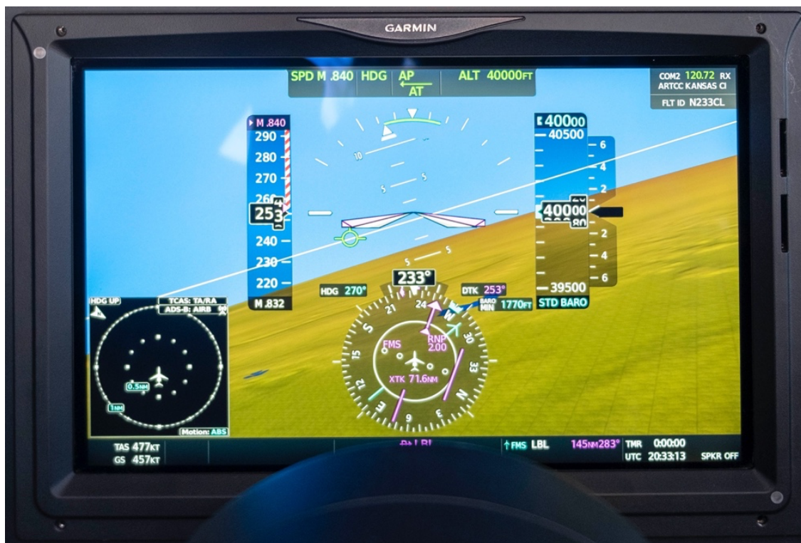
Testing VMO at 40,000 feet

A gentle pull to what looked to be around 10 degrees of pitch allowed us to alight gently and we were airborne. Pull forces were not substantial and it was easy to bring the nose up without over-rotating. If there was any pitch change due to flap retraction, I didn't notice it, I was too busy adding nose down trim to compensate for our rapid acceleration. The flaps had just made it to their fully retracted position when we were asked to turn 40-degrees. Here again the aileron forces seemed heavy, reminding me my days flying a Gulfstream III. But I soon got used to needing more muscle power in the roll axis and after a while I forgot it was ever a concern. Capturing and holding a 250-knot climb speed was easily done and passing about 10,000 feet I decided to give the autopilot the fun of flying the airplane while I turned my attention to navigation and other cockpit duties. The autopilot accelerated us to 270 knots until 0.76 Mach, which it then maintained.