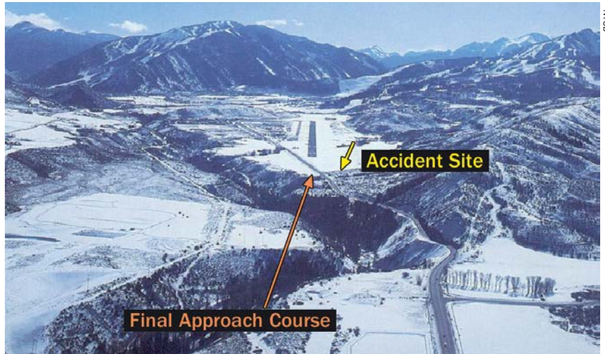
Gulfstream III N303GA approach path

Unfortunately, the charter customer and his passengers arrived late to the airplane in Los Angeles, which delayed the Gulfstream’s arrival at Aspen a few minutes later than allowed by the nighttime restriction. The charter customer stressed the importance of landing at