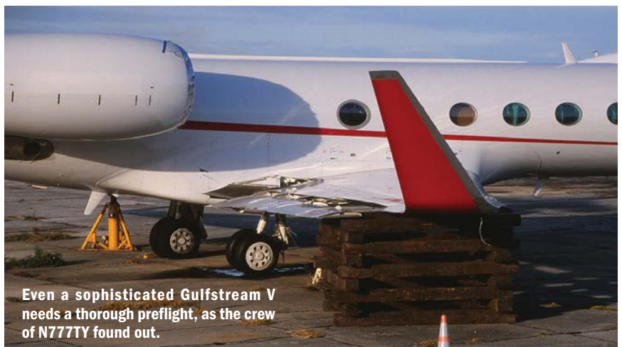
Even a sophisticated Gulfstream V needs a thorough preflight, as the crew of N777TY found out.

The pilot’s primary responsibility once airborne is to get back on the ground safely, even if that means telling air traffic control you cannot obey their instructions any longer. Transmitting the word “MAYDAY,” repeated three times, is the universally accepted way